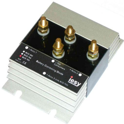
iesy BCD 703 (70A / 3 batteries)