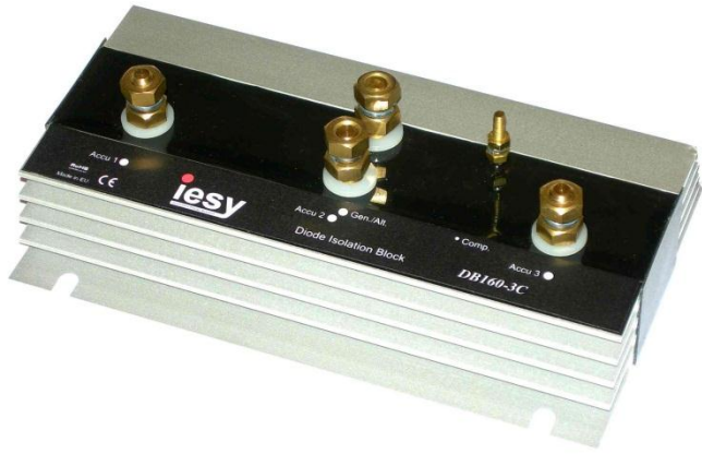
DB160-3C (Diode Block 160A / 3 batteries + comp. diode)